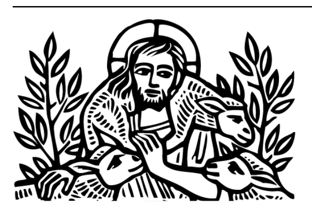
On Sunday, April 30th we celebrated Good Shepherd Sunday. Holy Mass that day was offered for all parishioners of the former Good Shepherd parish in Amsterdam,